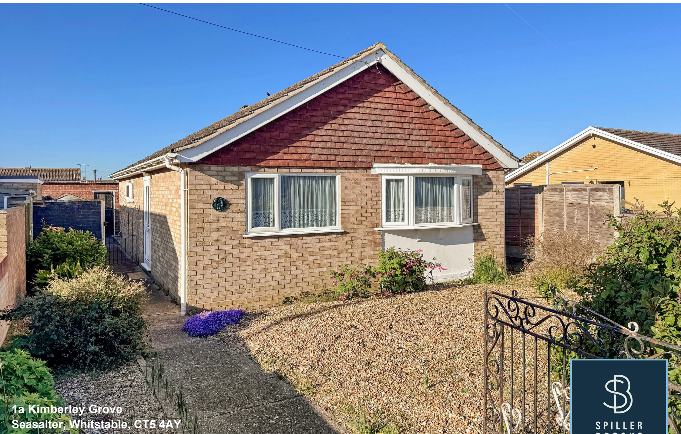
1a Kimberley Grove Seasalter, Whitstable, CT5 4AY