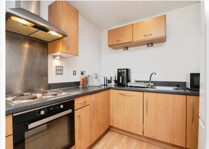
Spire Court Manor Road, Edgbaston Birmingham B16 9ND