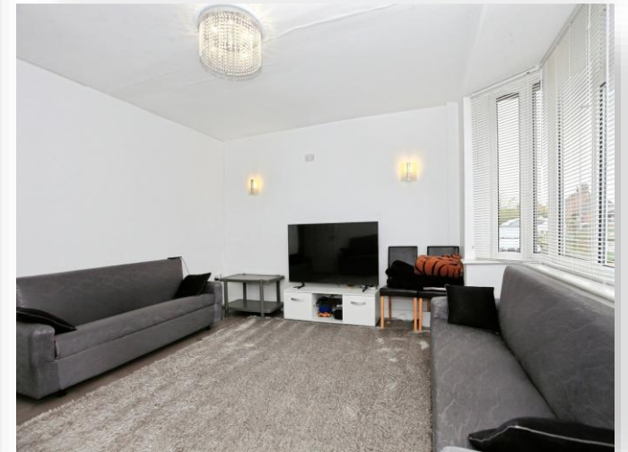
Welland Road, Dogsthorpe Peterborough PE1 3SX