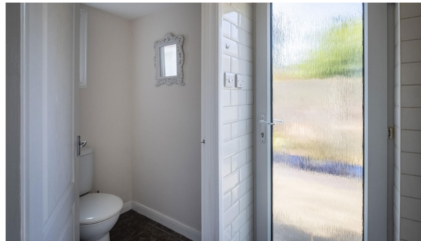
Rear lobby and WC