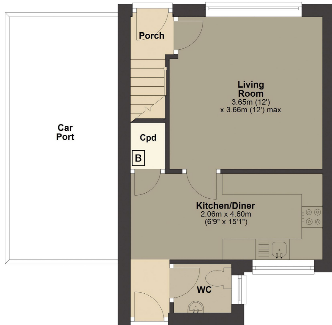
Ground Floor Approx. 29.8 sq. metres (320.3 sq. feet) (excluding Car Port)