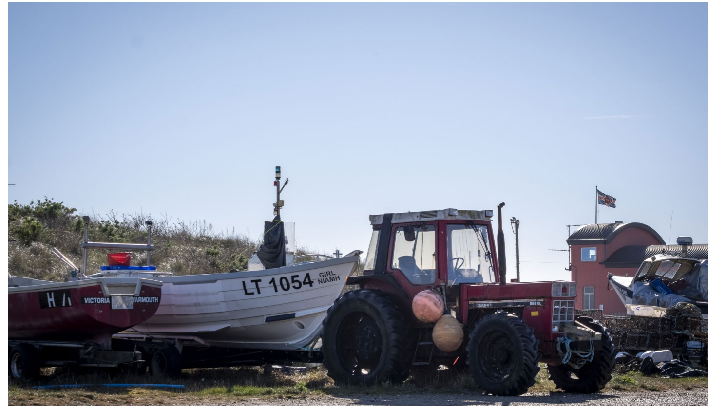
Caister lifeboat museum and cafe nearby