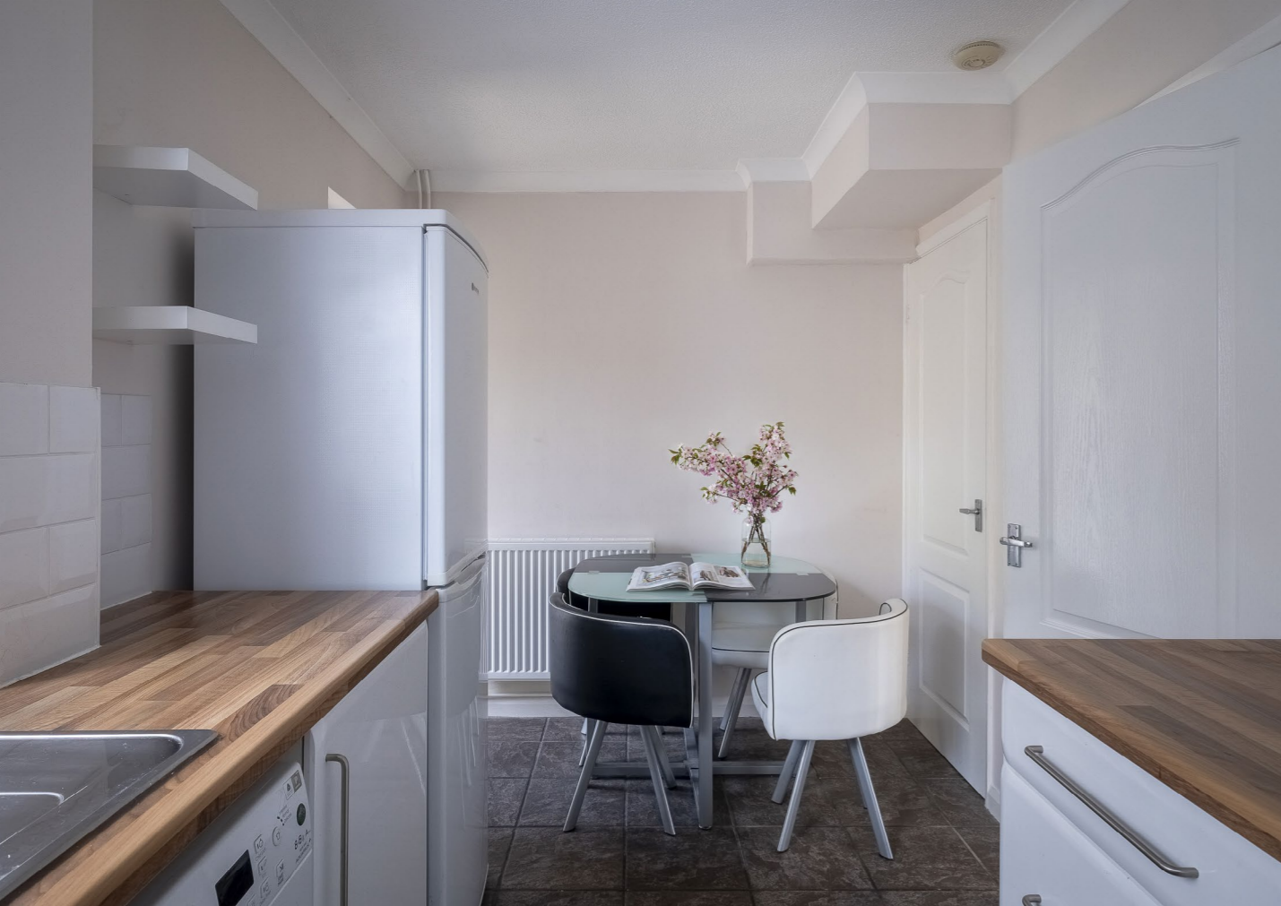
Kitchen dining area