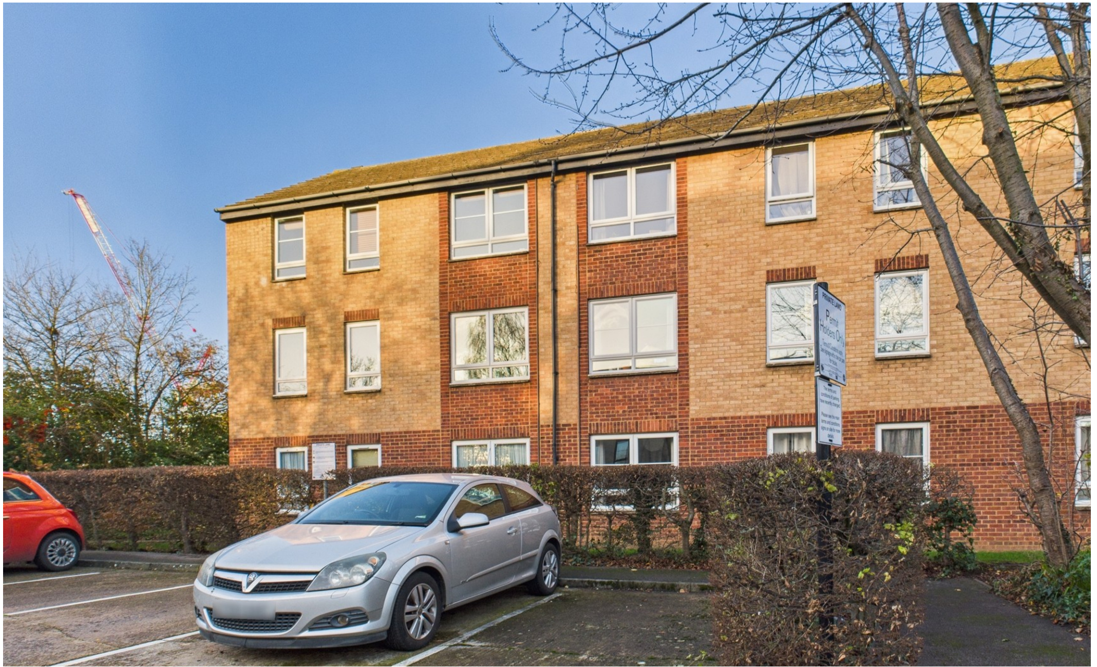
William Smith Close, Cambridge CB1 3QF