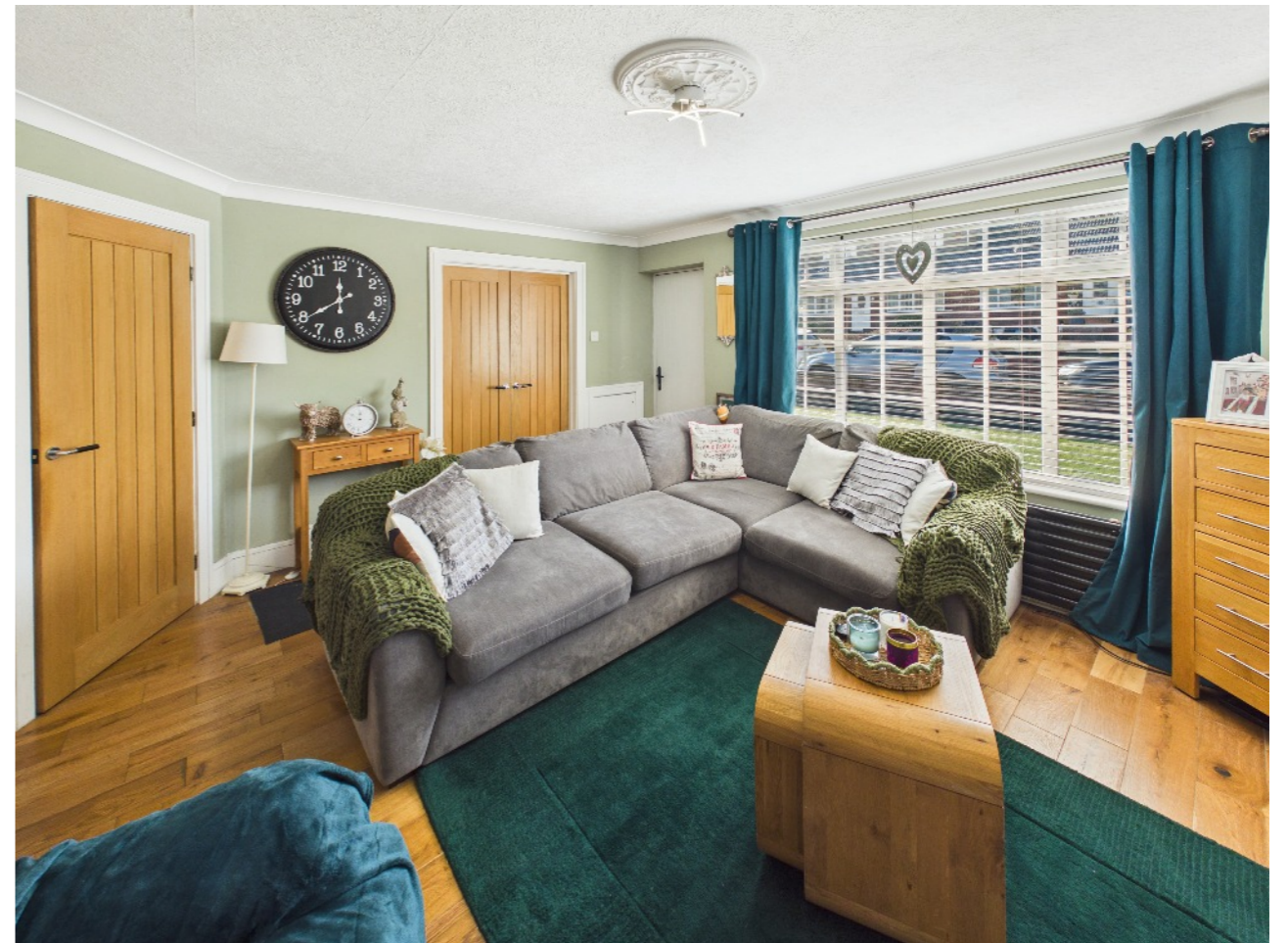
Bowland Grove, Milnrow OL16 4EX