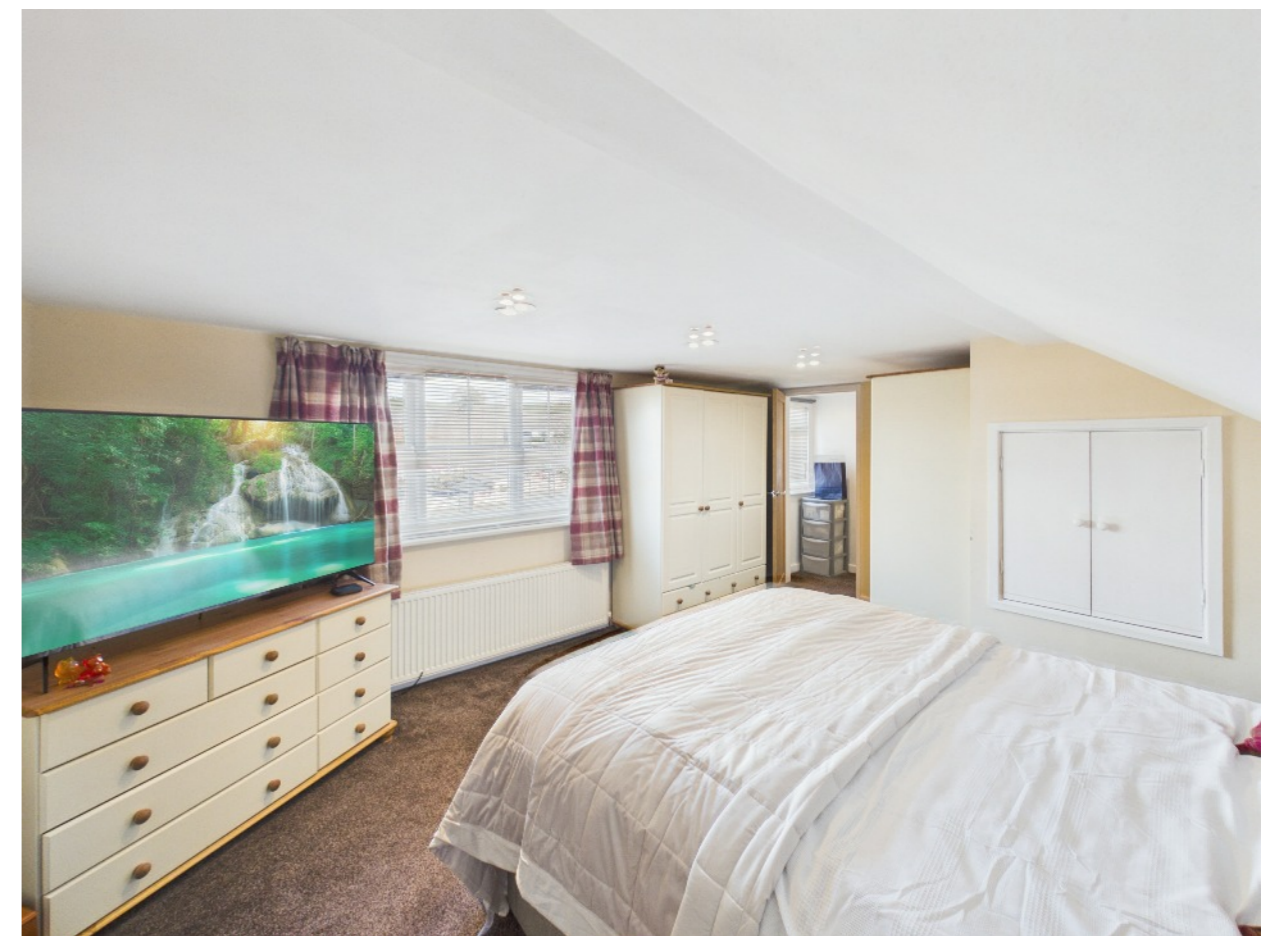
Bowland Grove, Milnrow OL16 4EX