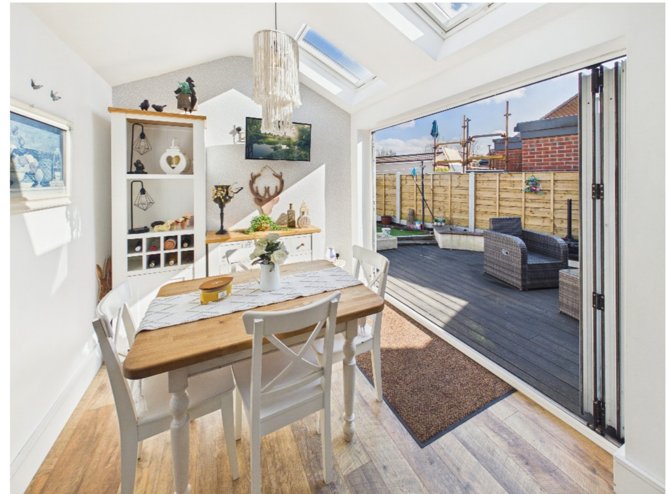
Bowland Grove, Milnrow OL16 4EX