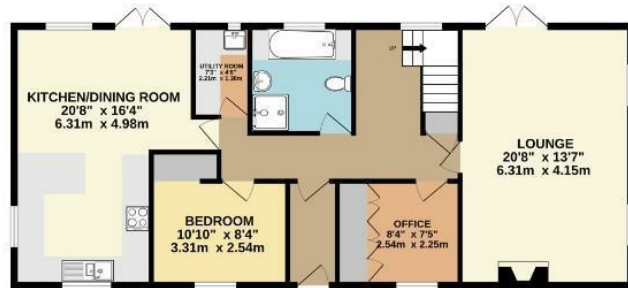
GROUND FLOOR 1011 sq.ft. (93.9 sq.m.) approx.