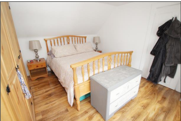
Bedroom 1 (12' x 10'6" / 3.65m x 3.23m) Front facing window and laminate flooring.

Staircase with oak banister leads to the upper hallway. Feature stone wall. Gives access to the 2 bedrooms. Hatch access to loft and velux window.