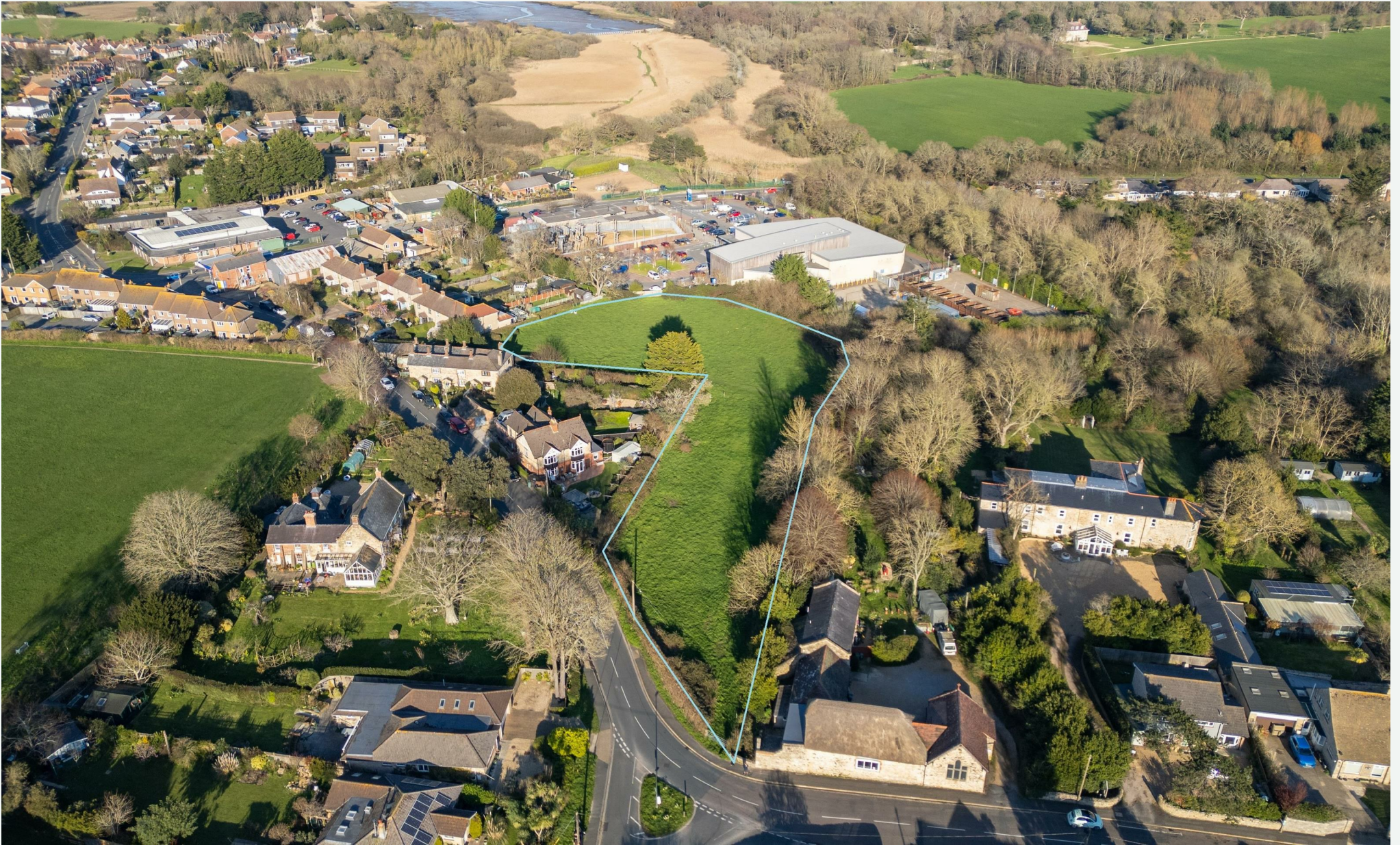
Stroud Field, Freshwater, Isle of Wight