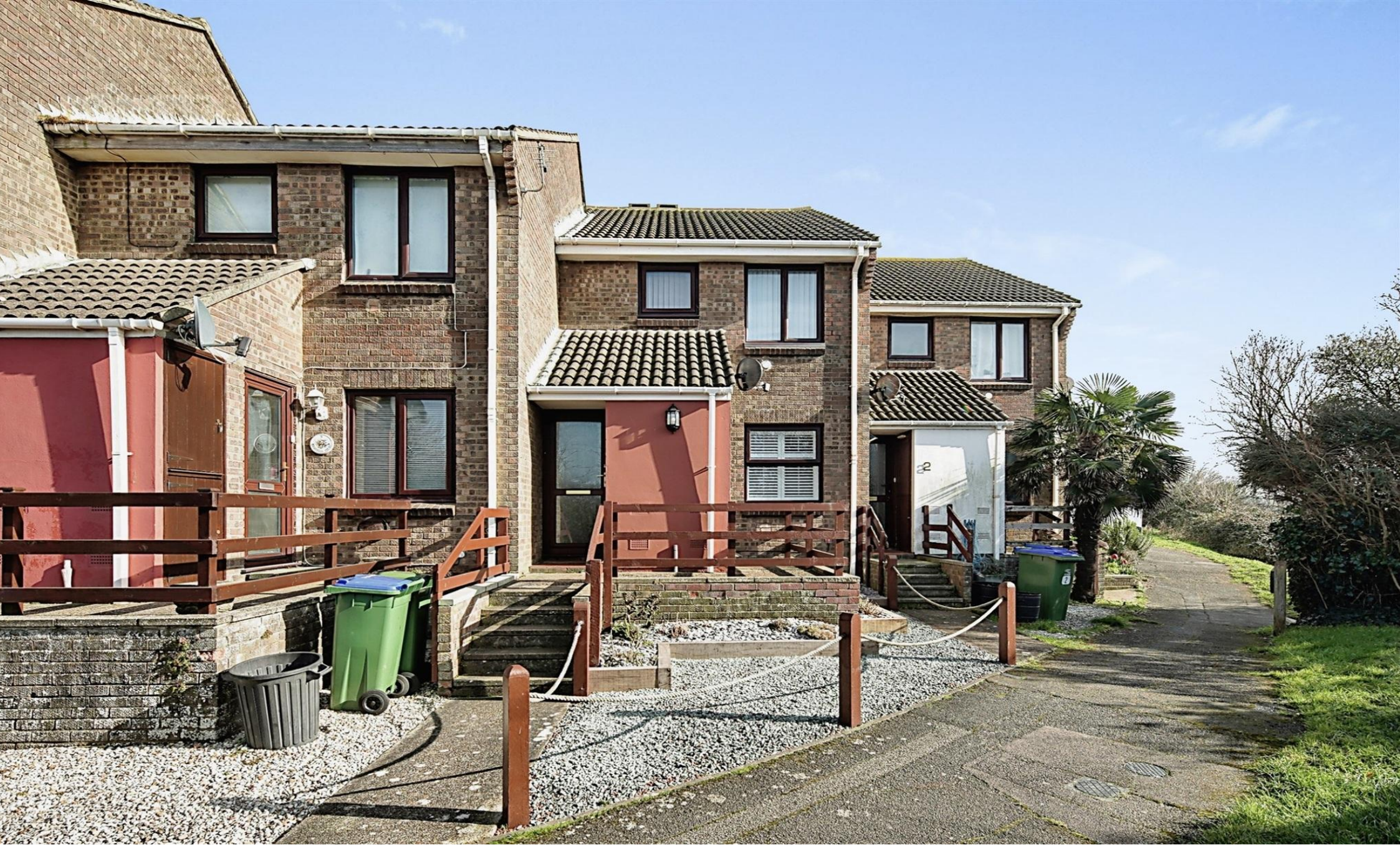
Martello Court St Martins Crescent, South Highton Newhaven BN9 0PH