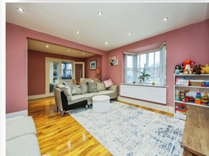
Linden Avenue, Nottingham NG11 8SB