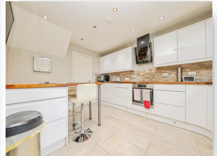
Burr Close, Ramsey Harwich CO12 5EN