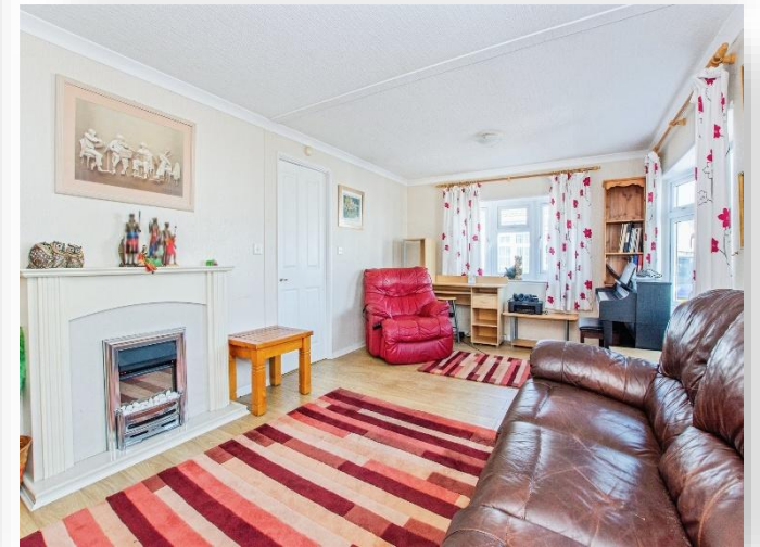
Grove Park, Magazine Lane, WISBECH PE13 1LF