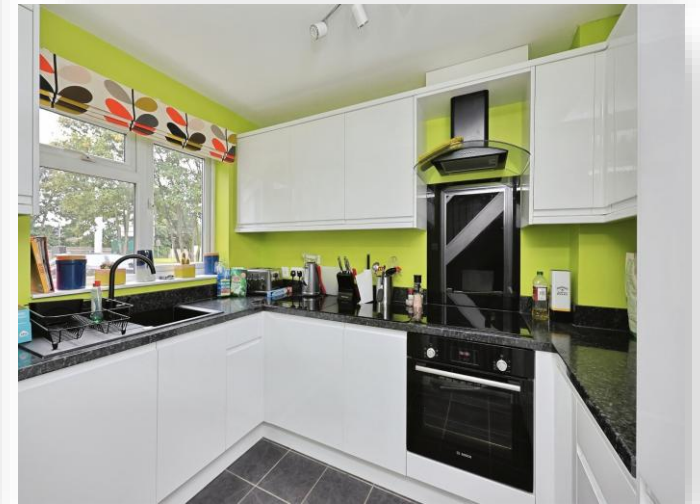
School Lane, Sprowston, Norwich, NR7 8TR