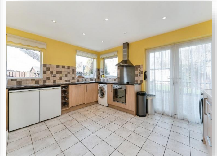
Crabbes Close, Feltwell, Thetford, IP26 4BD