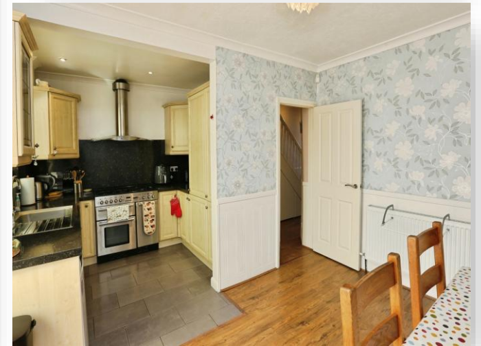
Chantry Road, GOSPORT PO12 4NF