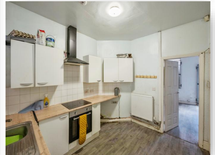
Elizabeth Street, Goldthorpe Rotherham S63 9NA