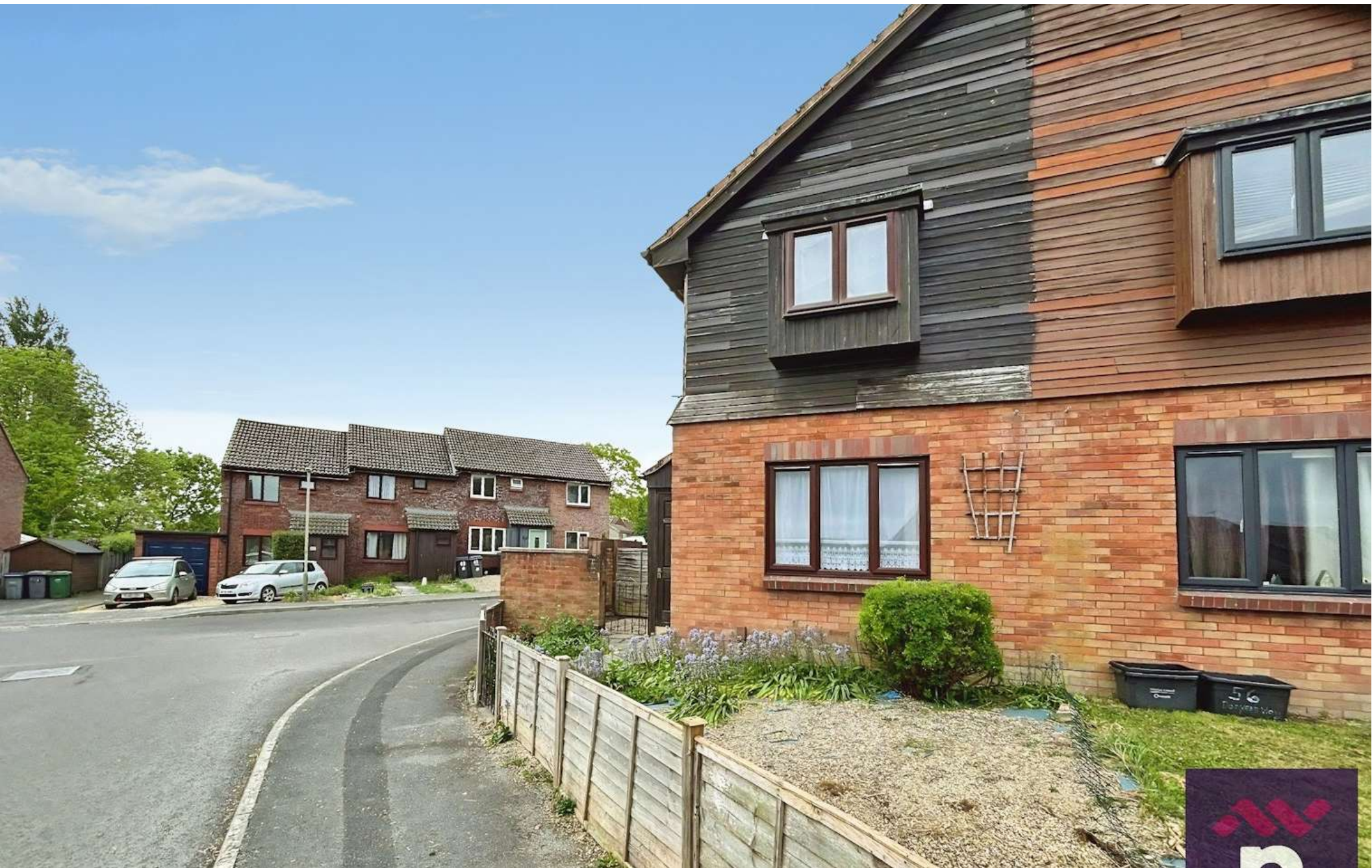
Danvers Way , Westbury