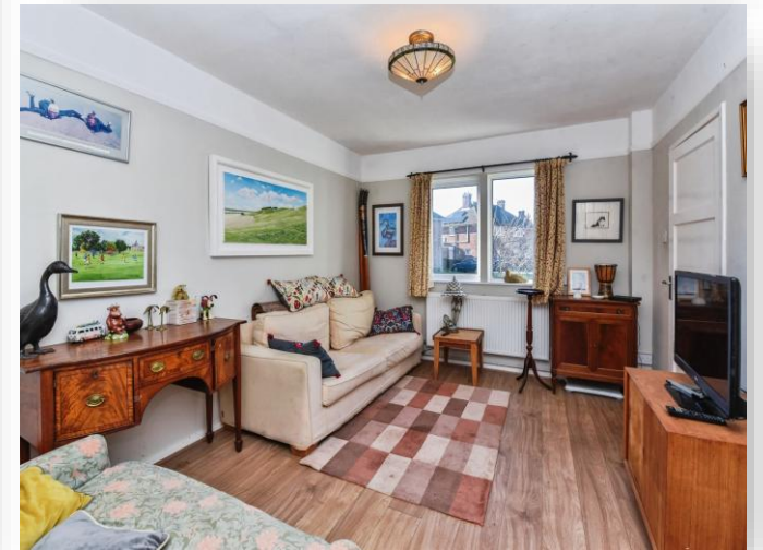
Ferozeshah Road, Northfields Devizes SN10 2JQ