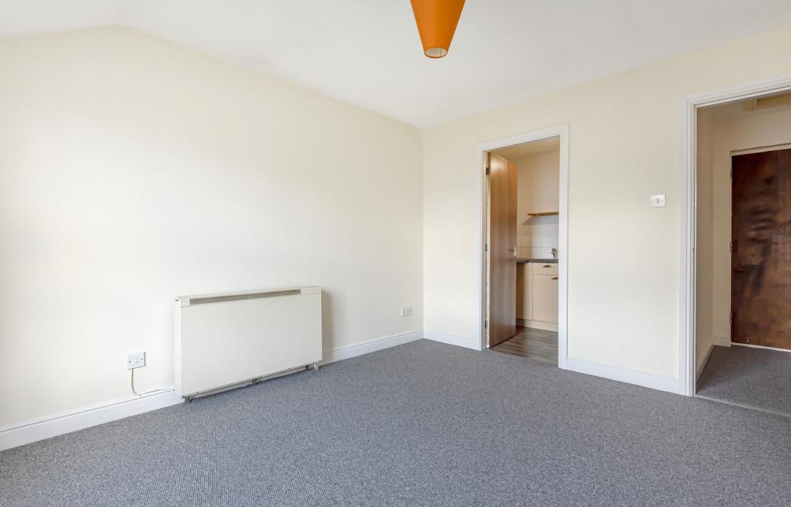
Typical Living Room