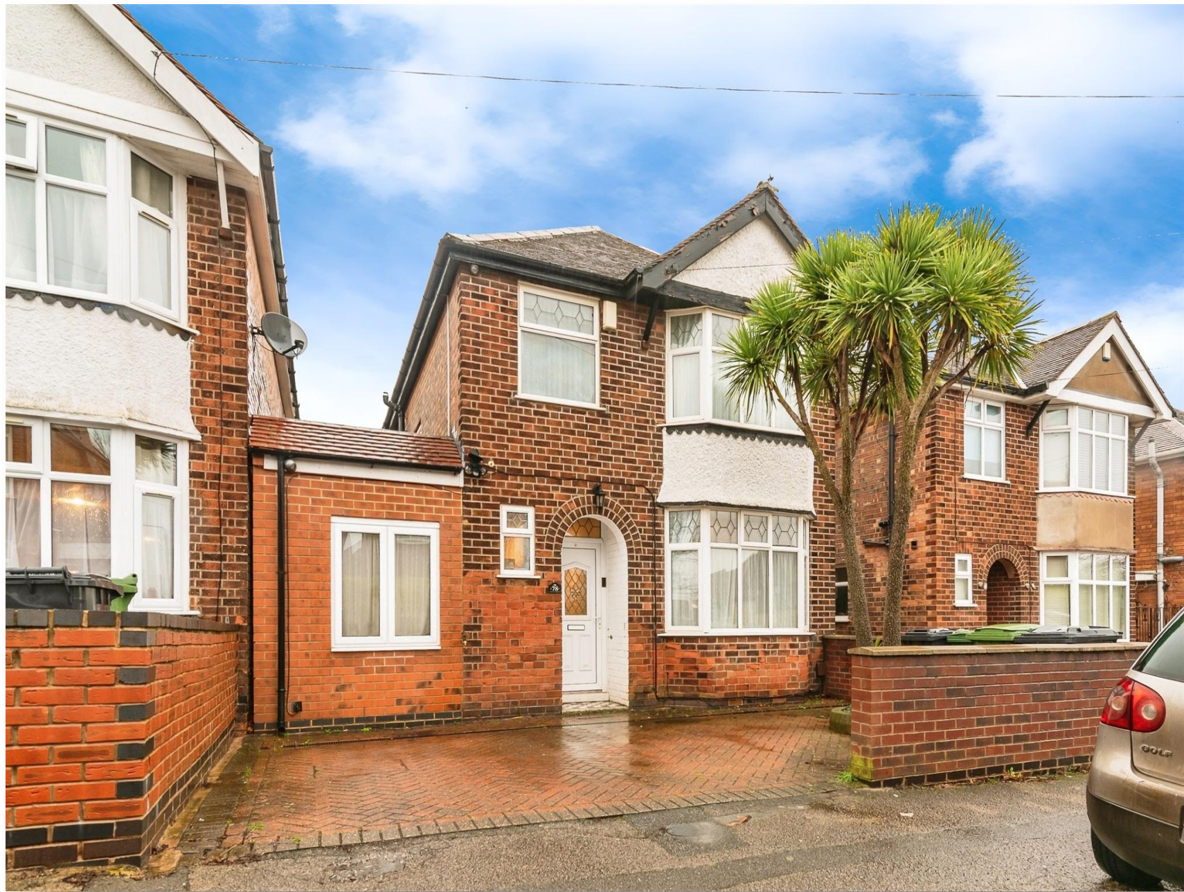
Cliff Road, Carlton Nottingham NG4 1BT