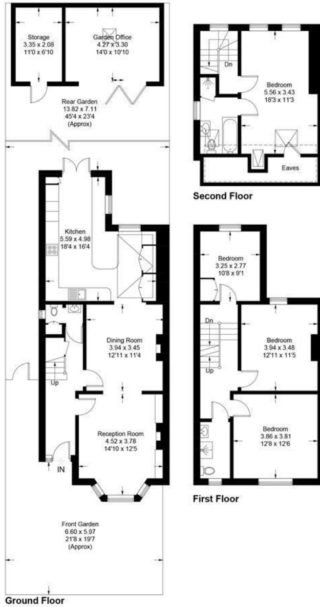
Illustration for identification purposes only, measurements are approximate, not to scale. Fourlabs.co © (ID1295811)