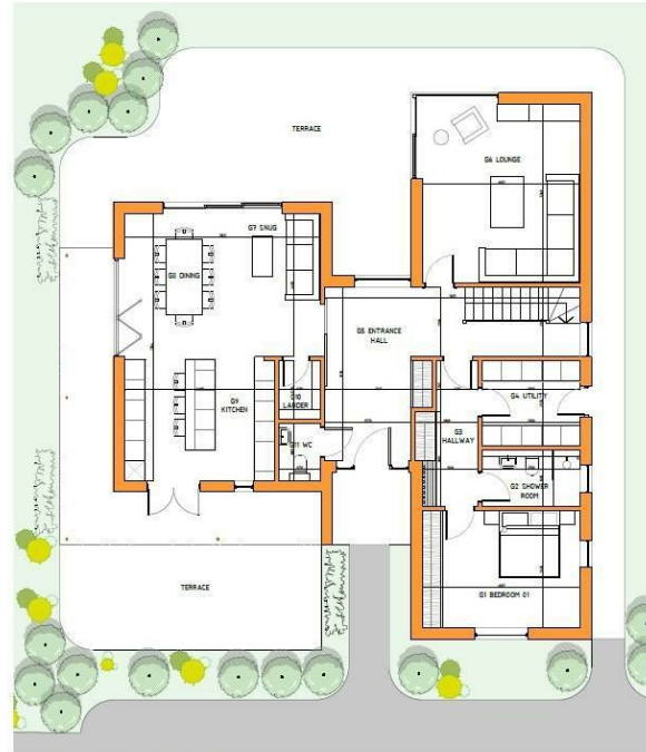
N PROPOSED GROUND FLOOR PLAN 1:50 @ A2

Just a few hundred yards from the property, at the end of Brambles Lane, a footpath leads to the popular sandy beach at Colwell Bay, home to the renowned coastal restaurant The Hut. Slightly further along the coast lies Totland Bay, which features The Waterfront public house, offering additional seaside dining options. Freshwater village centre, with its range of shops, services, and amenities, is located within a mile, while a bus stop just a few yards from the property provides regular services between Yarmouth and Freshwater/Totland, ensuring convenient access to local facilities. The mainland ferry terminal at the harbour town of Yarmouth is situated just a couple of miles away, offering straightforward connections to the mainland.