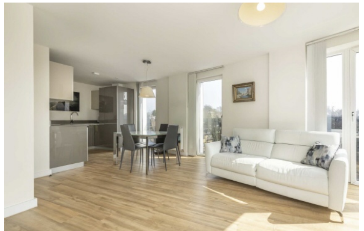
Finchley Road, NW11