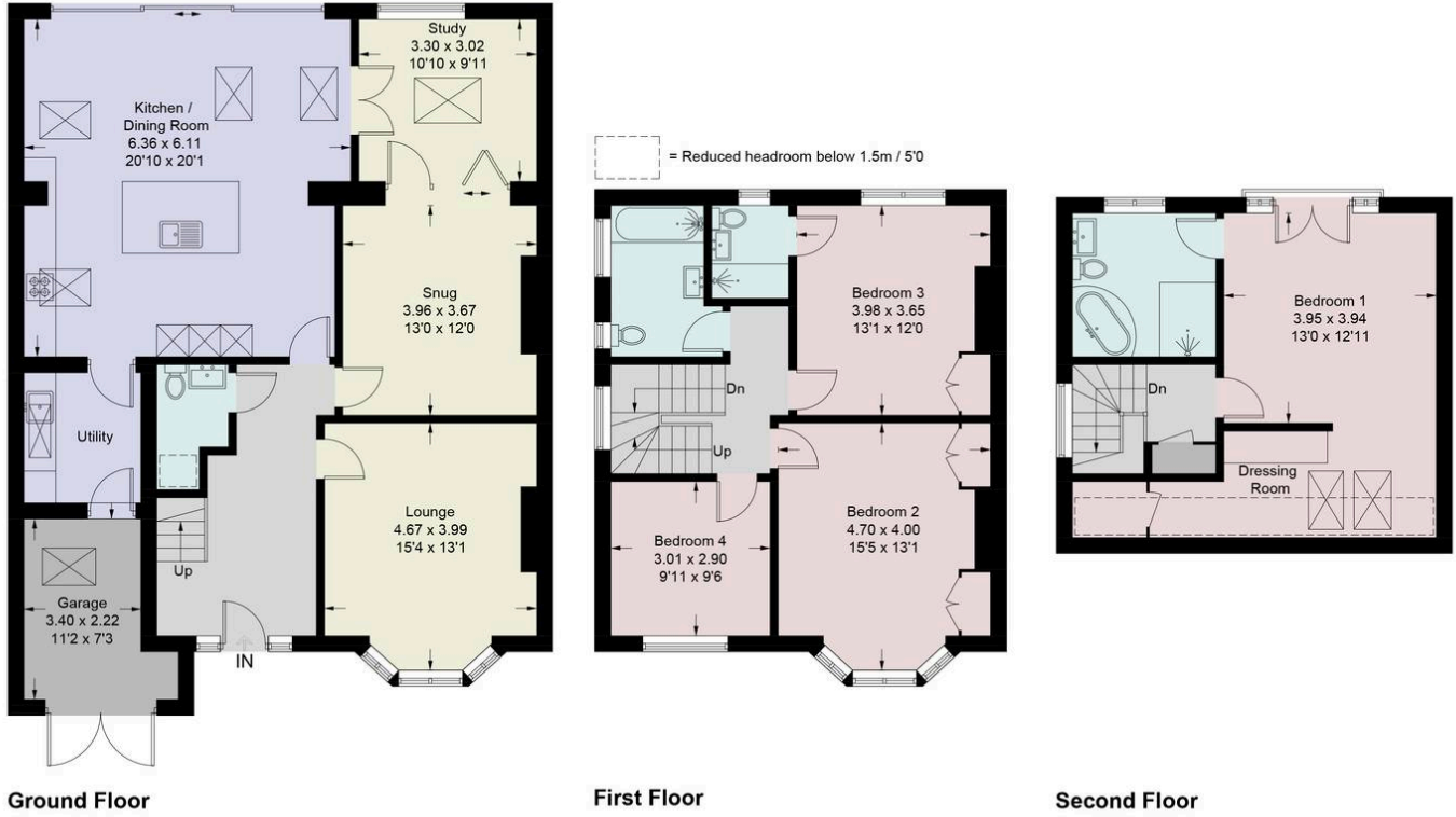
Illustration for identification purposes only, measurements are approximate, not to scale. Pursuant to RICS property measurement 2nd edition © Intelligent Property Marketing 2026

Main House = 203.4 sq m / 2189 sq ft Limited Use Area = 5.6 sq m / 60 sq ft Garage = 8.4 sq m / 90 sq ft Approximate Gross Internal Area = 217.4 sq m / 2339 sq ft