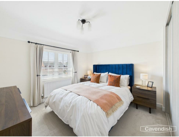
BEDROOM ONE 3.30m x 3.00m to front of wardrobe (10'10" x 9'10" to front of wardrobe)

UPVC double glazed window overlooking the front, ceiling light point, single radiator, and full height fitted double wardrobe with two sliding doors having hanging space and shelving. Door to en-suite shower room.