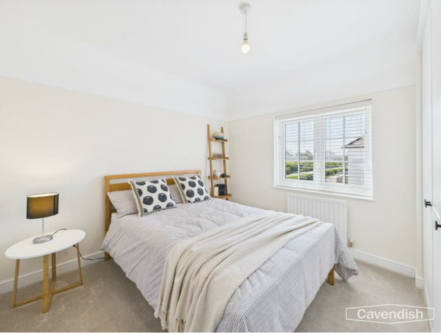
BEDROOM TWO 3.02m x 2.62m to front of wardrobe (9'11" x 8'7" to front of wardrobe)

UPVC double glazed window overlooking the front, ceiling light point, single radiator with thermostat, and full height fitted triple wardrobe with hanging space and shelving.