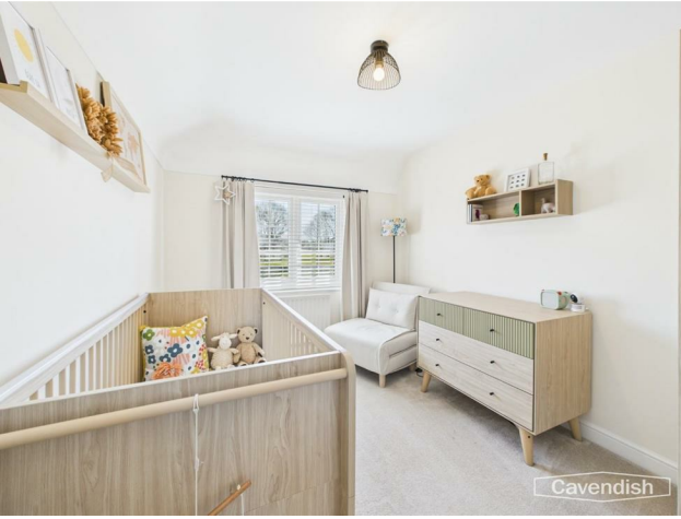
BEDROOM THREE 3.33m x 2.62m (10'11" x 8'7")

UPVC double glazed window, ceiling light point, and single radiator with thermostat.