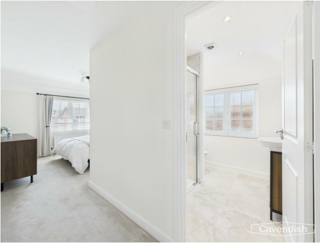
EN-SUITE SHOWER ROOM 2.16m x 1.98m overall (7'1" x 6'6" overall)

UPVC double glazed window overlooking the front, ceiling light point, single radiator, and full height fitted double wardrobe with two sliding doors having hanging space and shelving. Door to en-suite shower room.