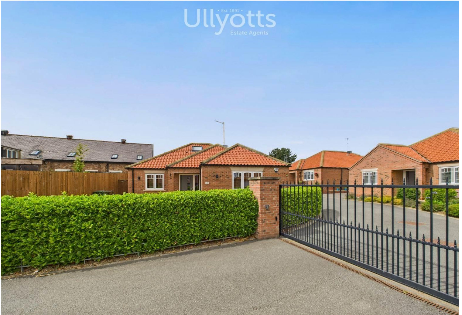
Remote controlled sliding gate