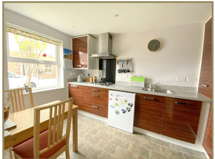
5 Sheldon Road, Scartho Top, North East Lincolnshire, DN33 3GA £165,000