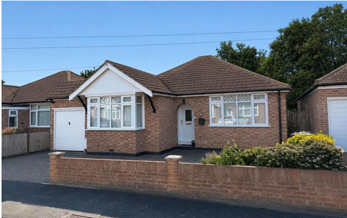
Homestead Road, Staines, TW18 2RD