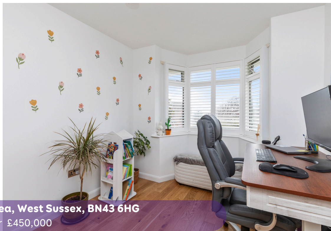
Downside, Shorehamby Sea, West Sussex, BN43 6HG Offers Over £450,000