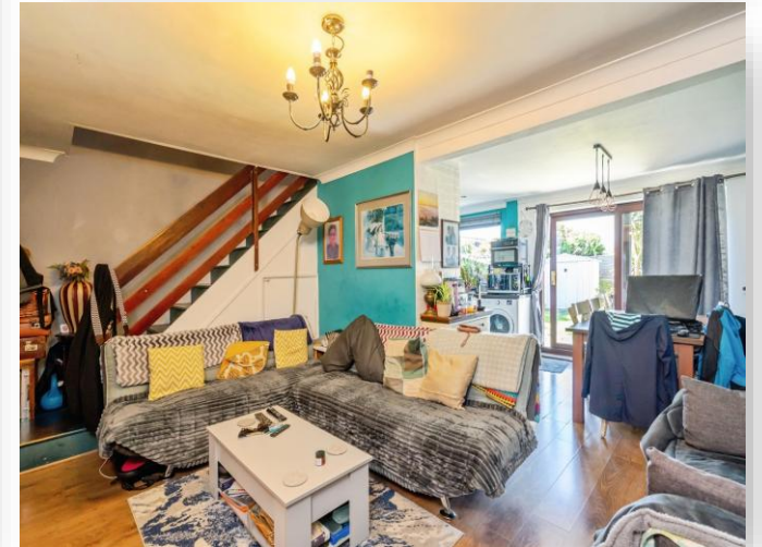
Addison Way, Bognor Regis PO22 9HZ