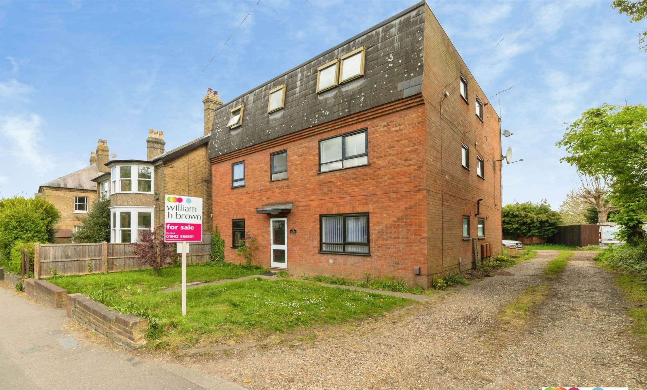
The Heathers London Road, Hertford, SG13 7LG