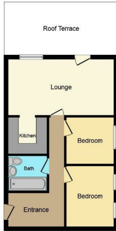
Floor area 45.0 sq. m. (484 sq. ft.) approx

Total floor area 45.0 sq. m. (484 sq. ft.) approx