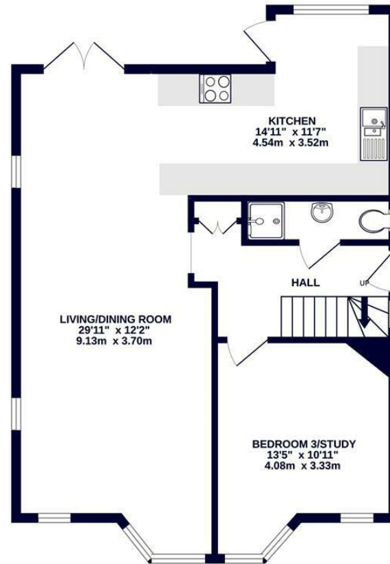
GROUND FLOOR 680 sq.ft. (63.2 sq.m.) approx.