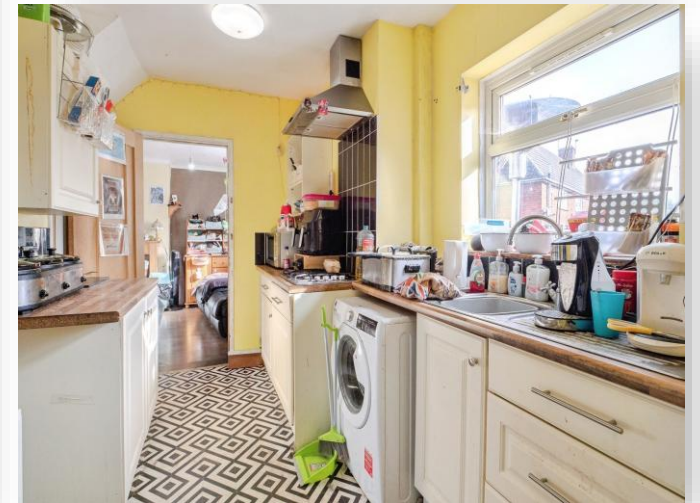
Babington Road, Barrow Upon Soar