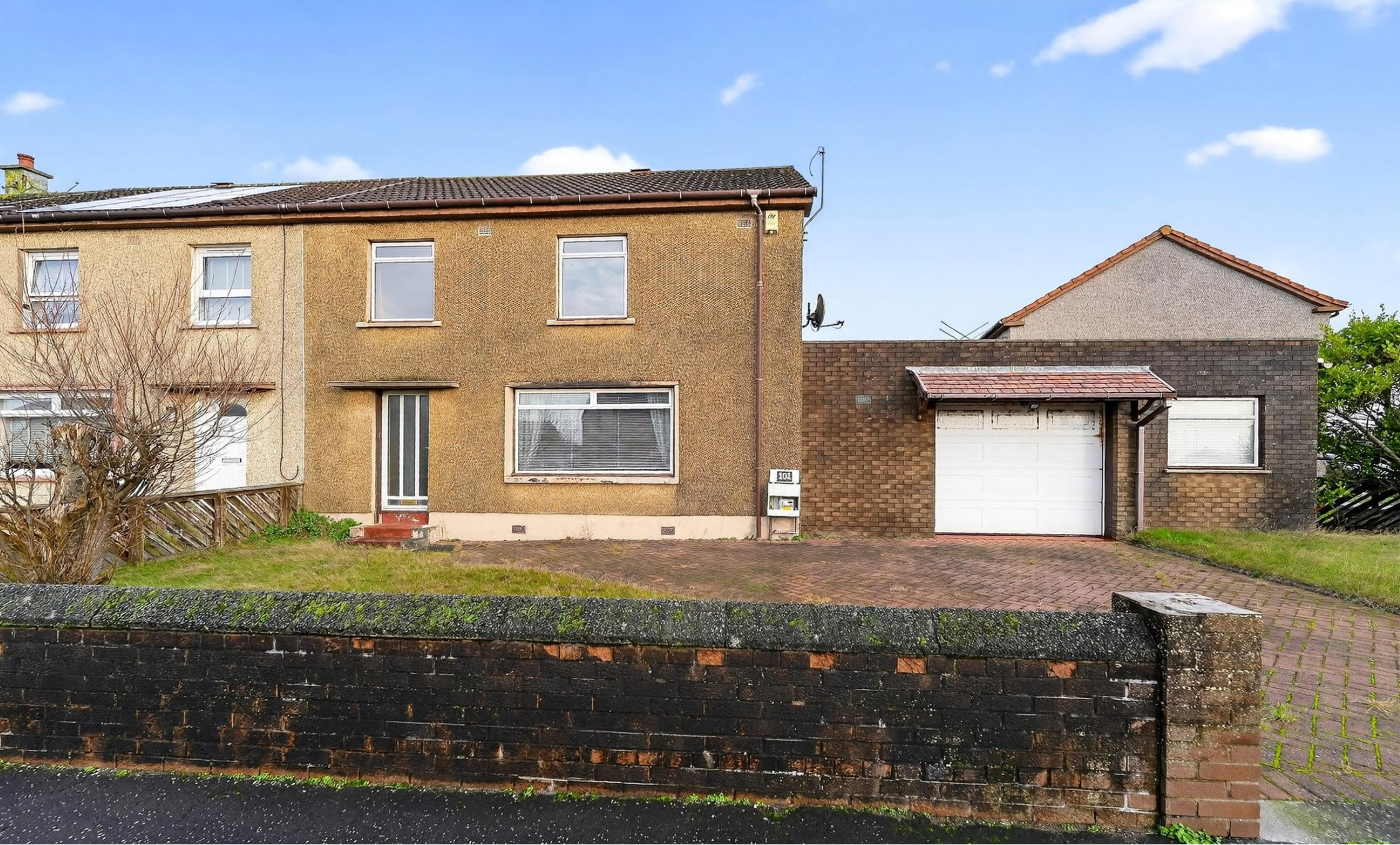
Misk Knowes, Stevenston KA20 3PJ