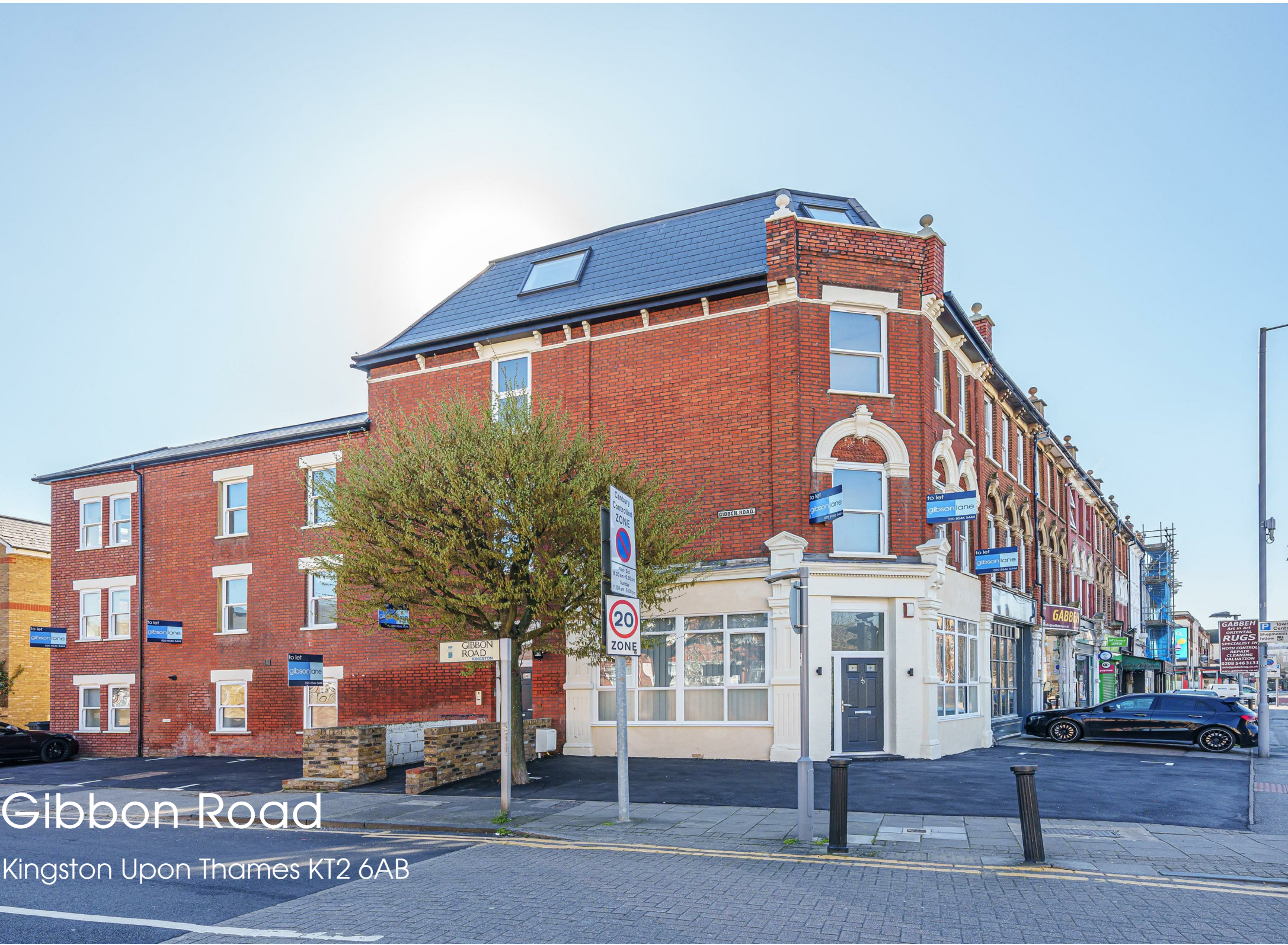
Gibbon Road Kingston Upon Thames KT2 6AB

Approximate Area = 755 sq ft / 70.1 sq m For identification only - Not to scale