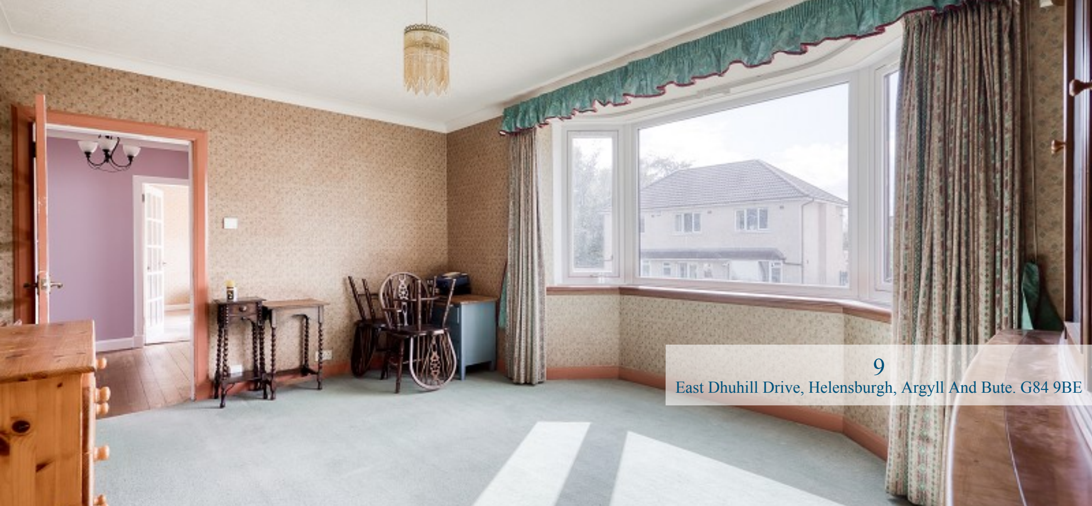
9 East Duhill Drive, Helensburgh, Argyll And Bute. G84 9BE