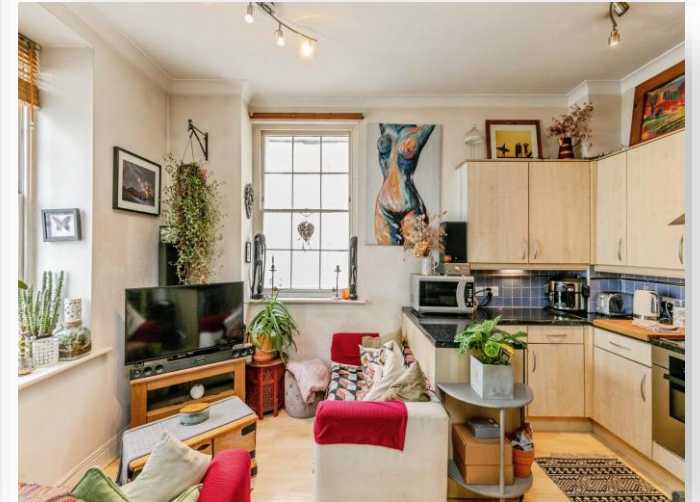
St. Clements Court Wilson Street, St Pauls Bristol BS2 9HA