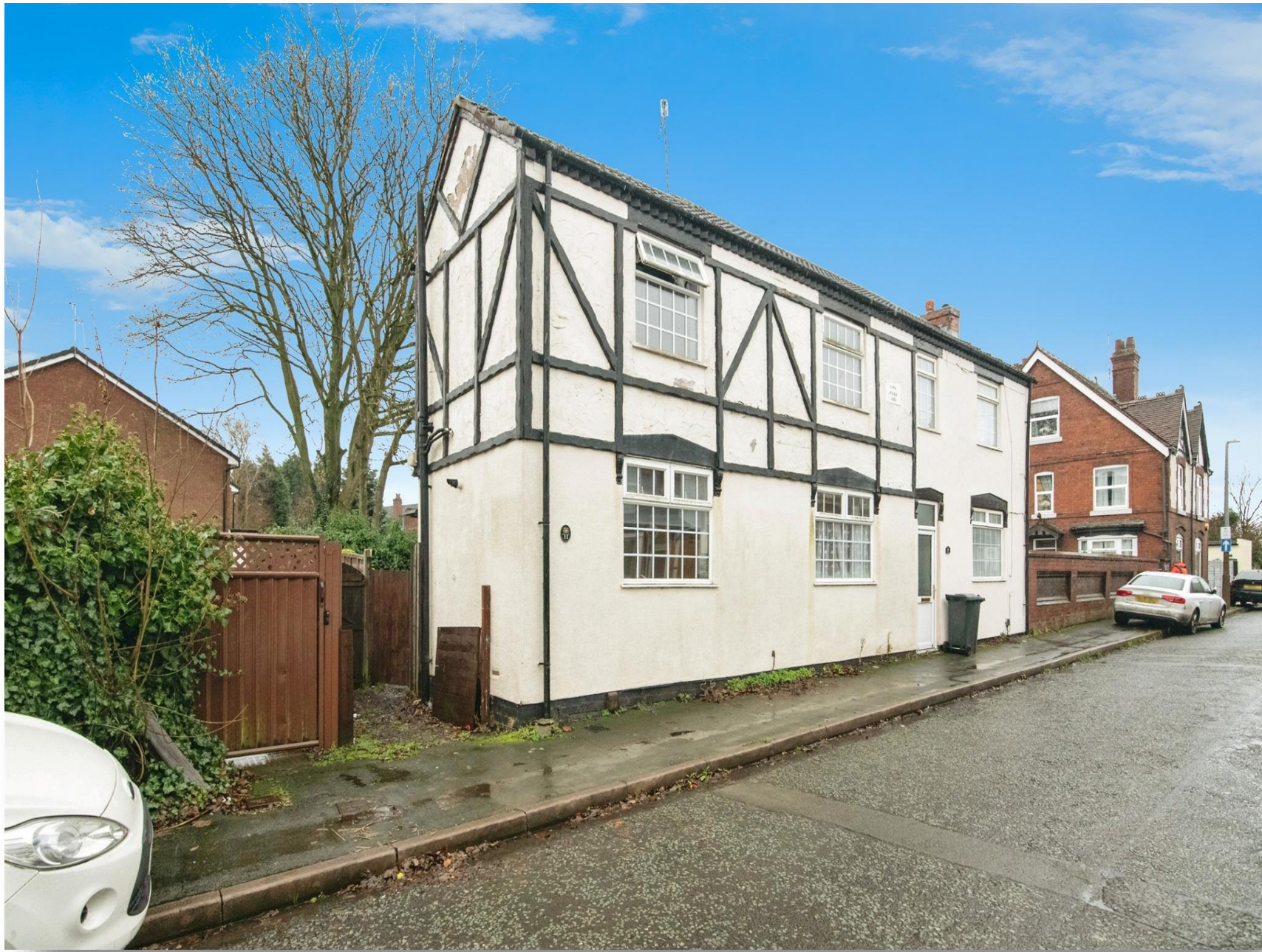
Victoria Street, Brierley Hill DY5 1RD