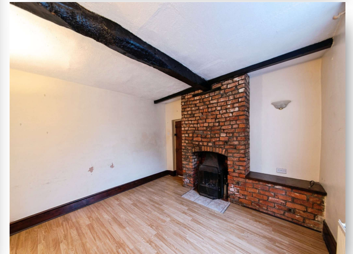
Church Street, Heckington Sleaford NG34 9RJ