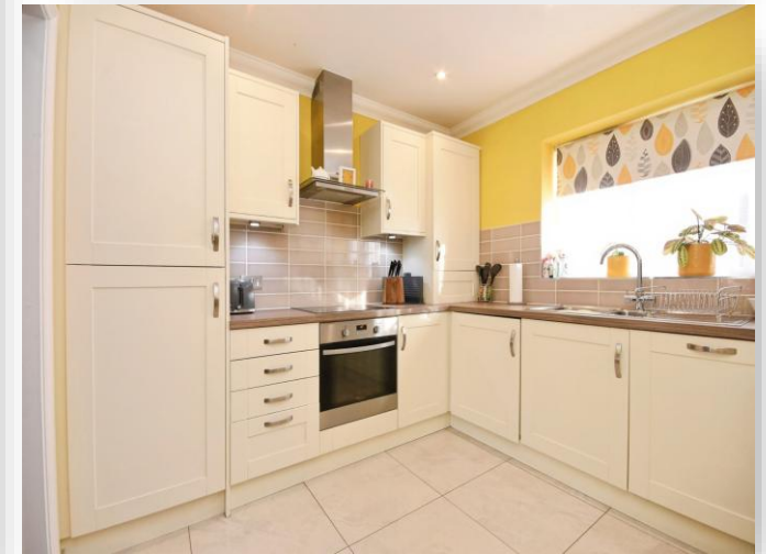
Conies Road, Halstead CO9 1BB