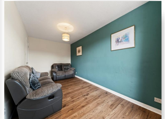
Burnhill Quadrant, Rutherglen Glasgow G73 1ER