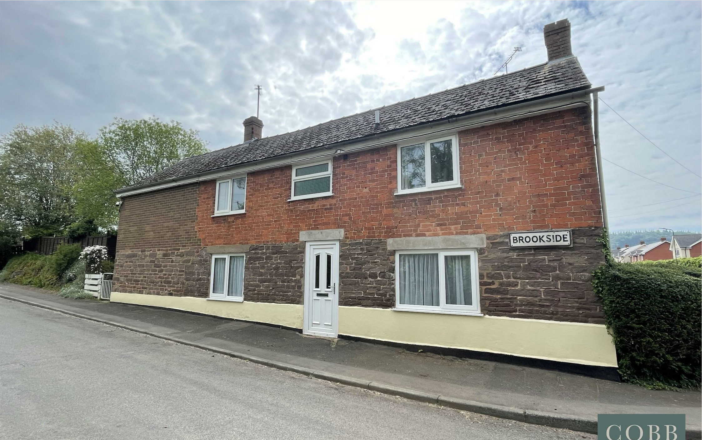
Brookside Cottage, Canon Pyon, Hereford, HR4 8NY Price £225,000