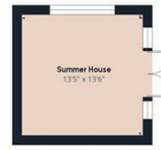
Floor 0 Building 4