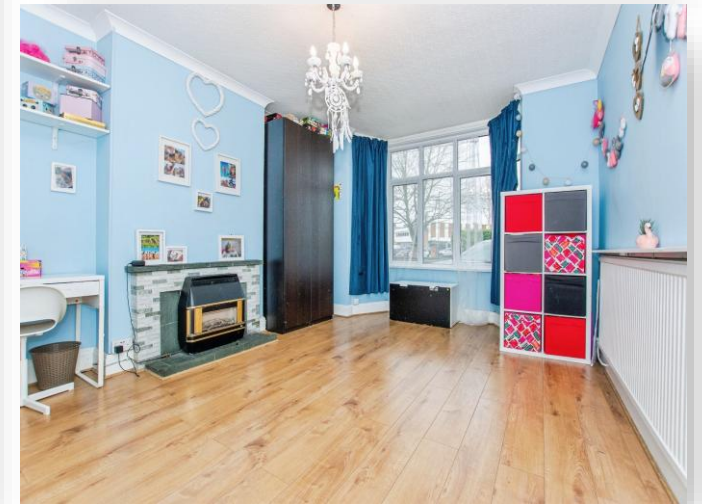
Queens Road, Wisbech, PE13 2PB