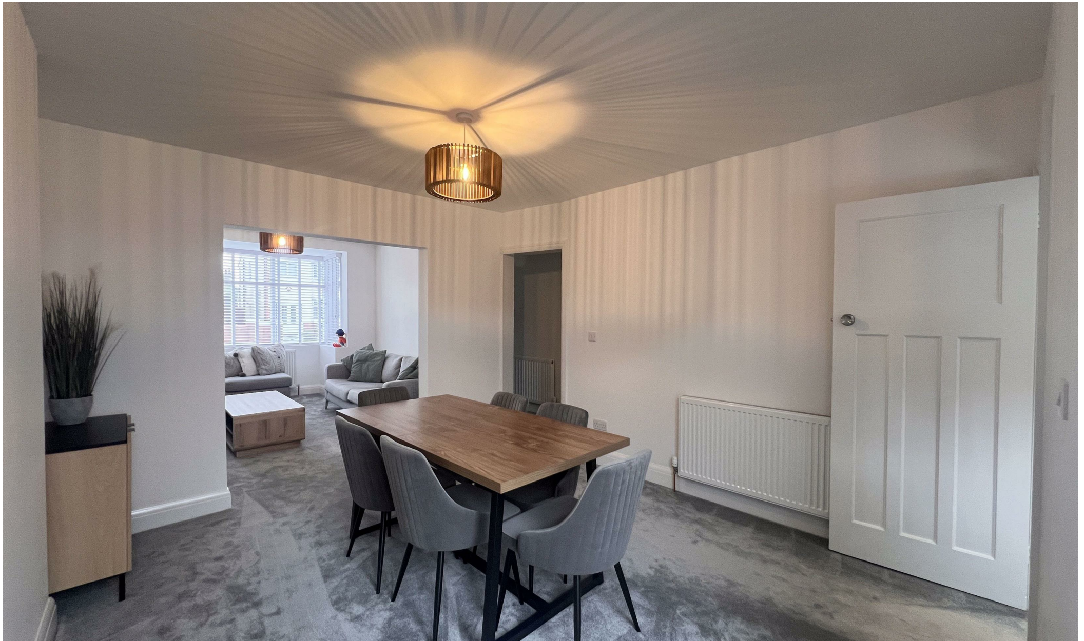
GOLF | CHARLOTTE HOUSE, GROUND FLOOR, 35-37 HOGHTON STREET, SOUTHPORT, MERSEYSIDE, PR9 0NS