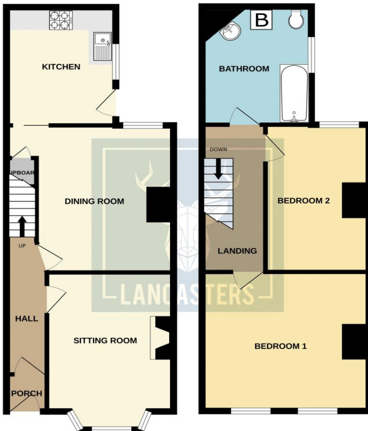
TOTAL FLOOR AREA: 911 sq.ft. (84.7 sq.m.) approx.

Whilst every attempt has been made to ensure the accuracy of the floorplan contained here, measurements of doors, windows, rooms and any other items are approximate and no responsibility is taken for any error, omission or mis-statement. This plan is for illustrative purposes only and should be used as such by any prospective purchaser. The services, systems and appliances shown have not been tested and no guarantee as to their operability or efficiency can be given. Made with Metropix ©2026