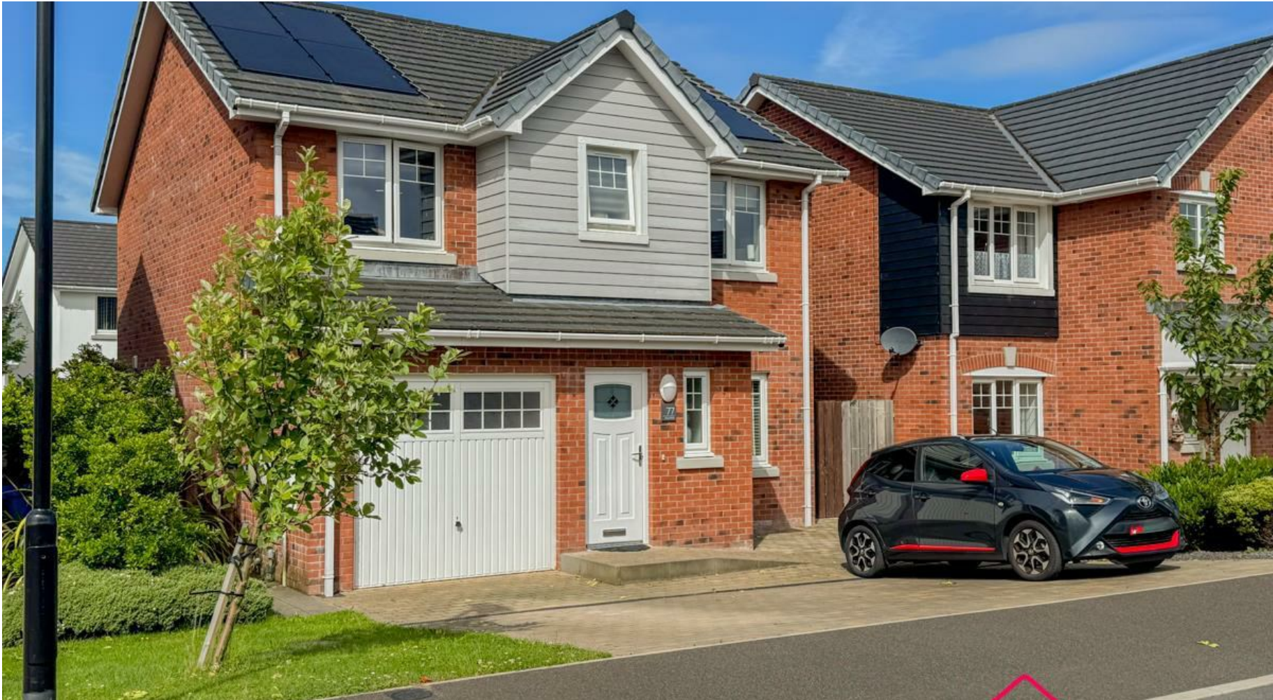
77 Royal Park, Ramsey, Isle Of Man, IM8 3UH Asking Price £499,950