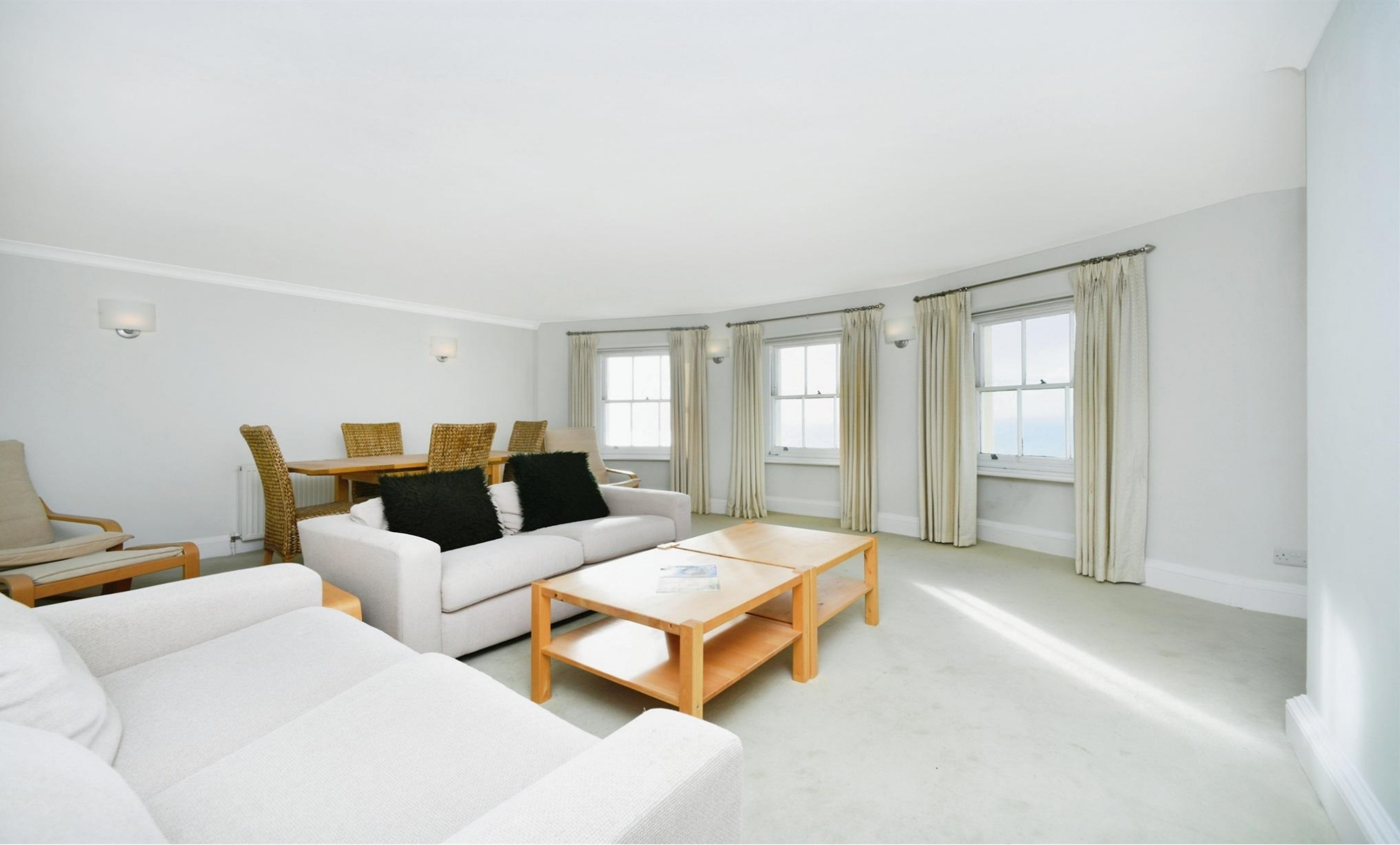
Percival Terrace, Brighton BN2 1FA